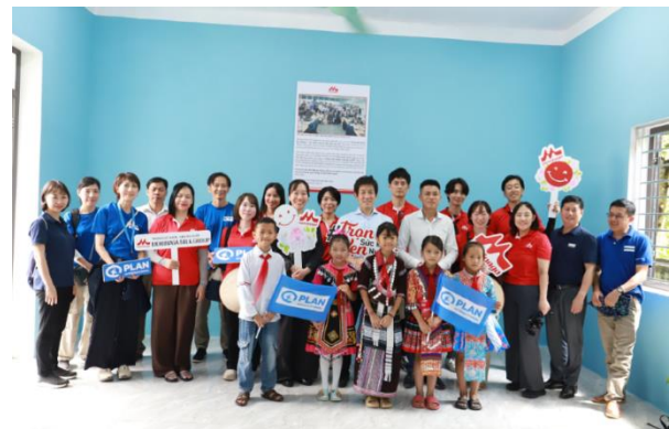
Children and Morinaga Milk Group employees