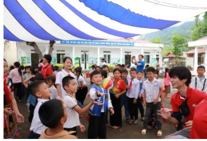
Interacting with the children through long-rope jumping and paper balloons