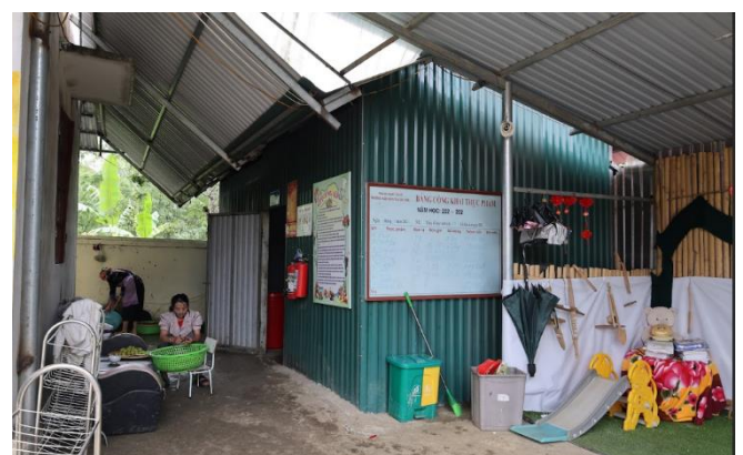
The current cooking facilities at the kindergarten