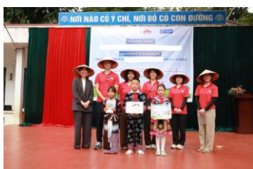
Presentation of gifts to the children