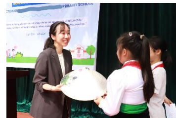
Presentation of a Traditional Vietnamese conical hat (Nón Lá)