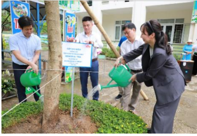
Commemorative tree planting at the elementary school