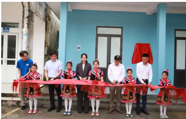
The ribbon-cutting at the handover ceremony

With the cooperation of Plan International, we completed the construction of children’s dining spaces and cooking facilities with improved sanitary conditions at one kindergarten and one elementary school in Lai Chau Province, and donated them to the Vietnamese Ministry of Education and Training. On May 19, a handover ceremony for the cooking facilities was held at the supported kindergarten and elementary school, attended by stakeholders of the support program, teachers and staff of the supported kindergarten and elementary school, parents, and children.